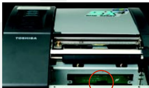
▲ UHF RFID antenna