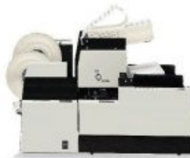
The 5002-KT2 can also work with the AMS 6001 Automatic Label Affixer