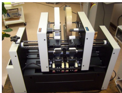
5002-KT2 Tabber Head 1 and 2 adjusted for close tab placement